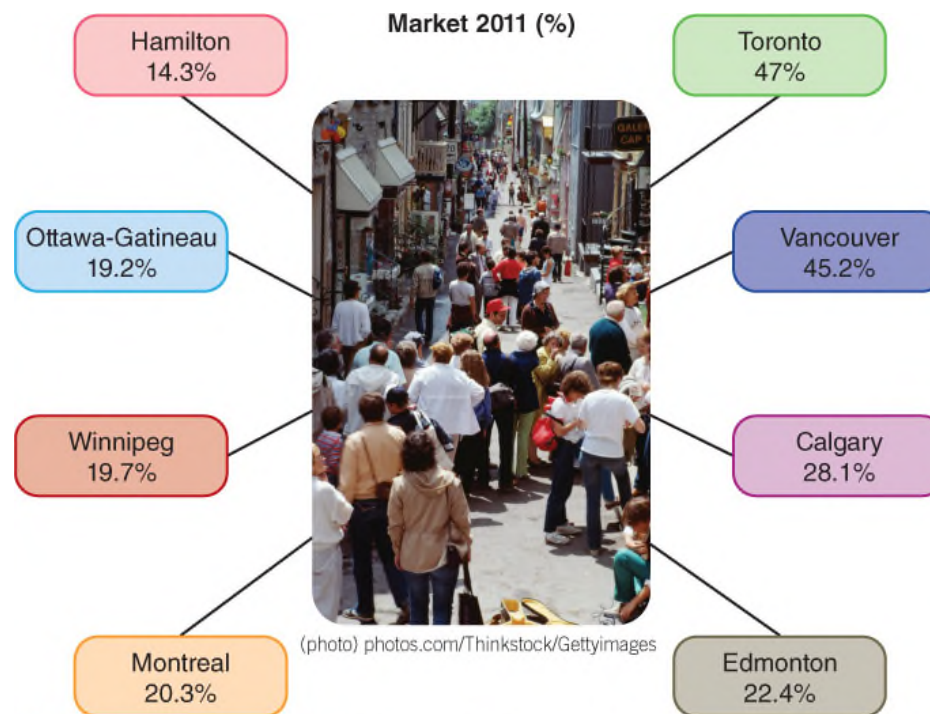
Figure 2.12 Canada's Ethnic Population as a Percentage of Each Market's Overall Population