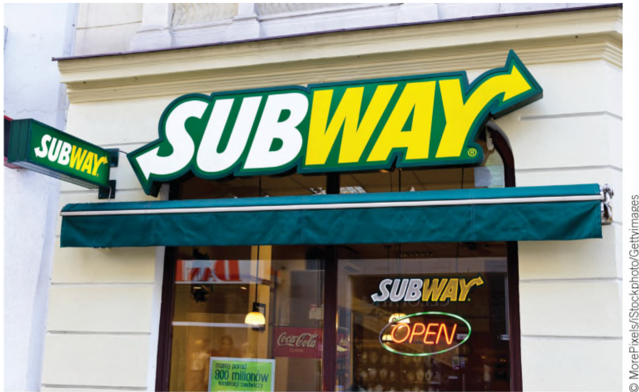
Figure 2.5 Subway dominates the fresh sandwich market in Canada.