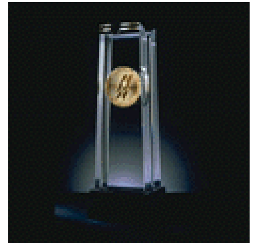
Baldrige Award trophy