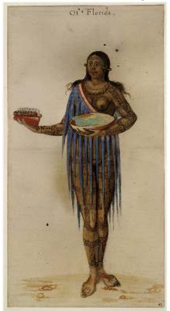
Florida Woman

Chapter 1, The American Promise: A History of the United States, Seventh Edition Copyright © 2017 by Bedford/St. Martin's Distributed by Bedford/St. Martin's Higher Education strictly focuse with its products. Not be redistribution.