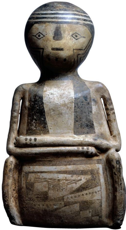
Anasazi Effigy

34. What can historians learn about the Anasazi people from their effigy figures?