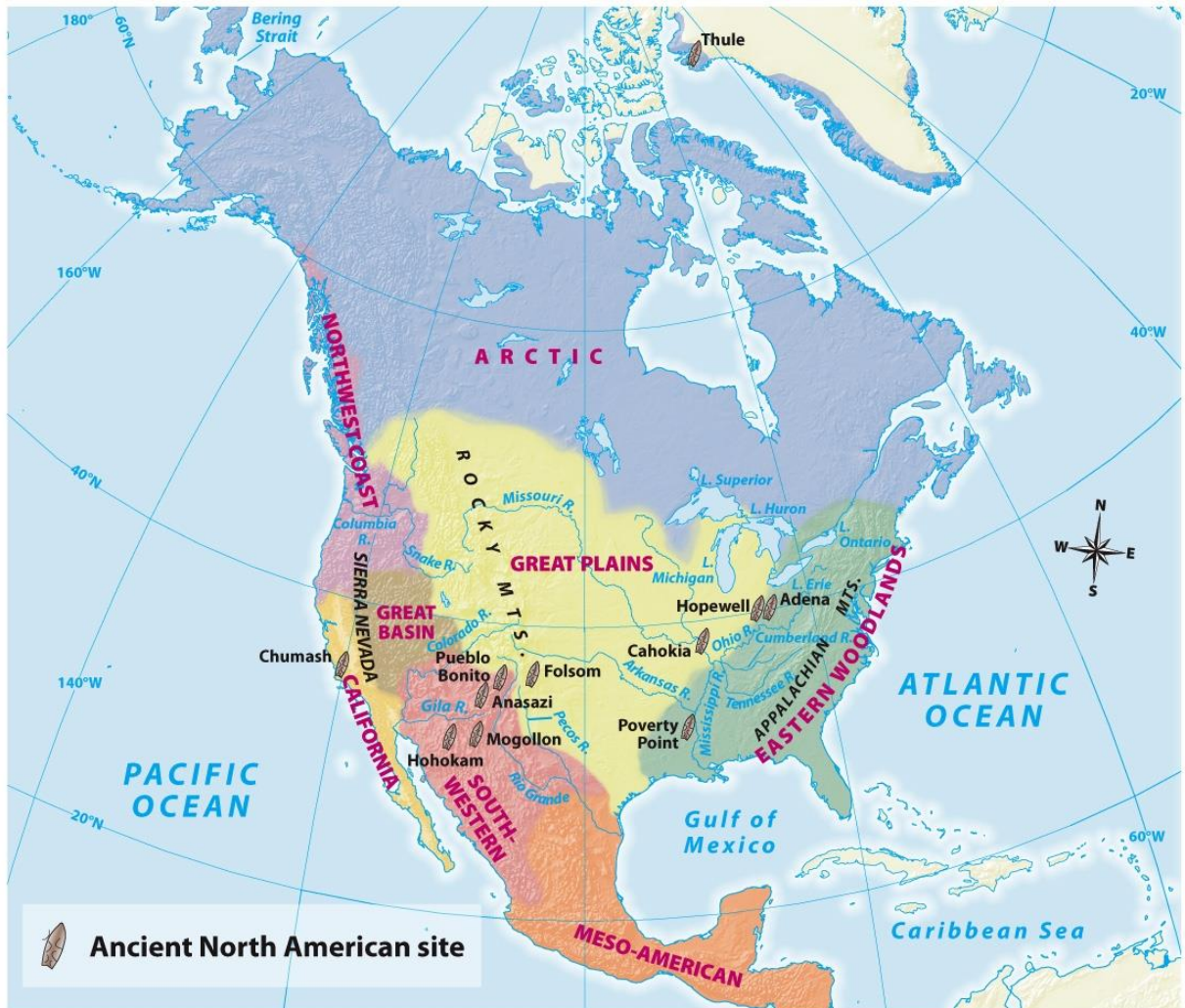
Map 1.2 Native North American Cultures Chapter 1, The American Promise: A History of the United States , Seventh Edition Copyright © 2017 by Bedford/St. Martin's Distributed by Bedford/St. Martin's/Macmillan Higher Education strictly for use with its products. Not for redistribution.