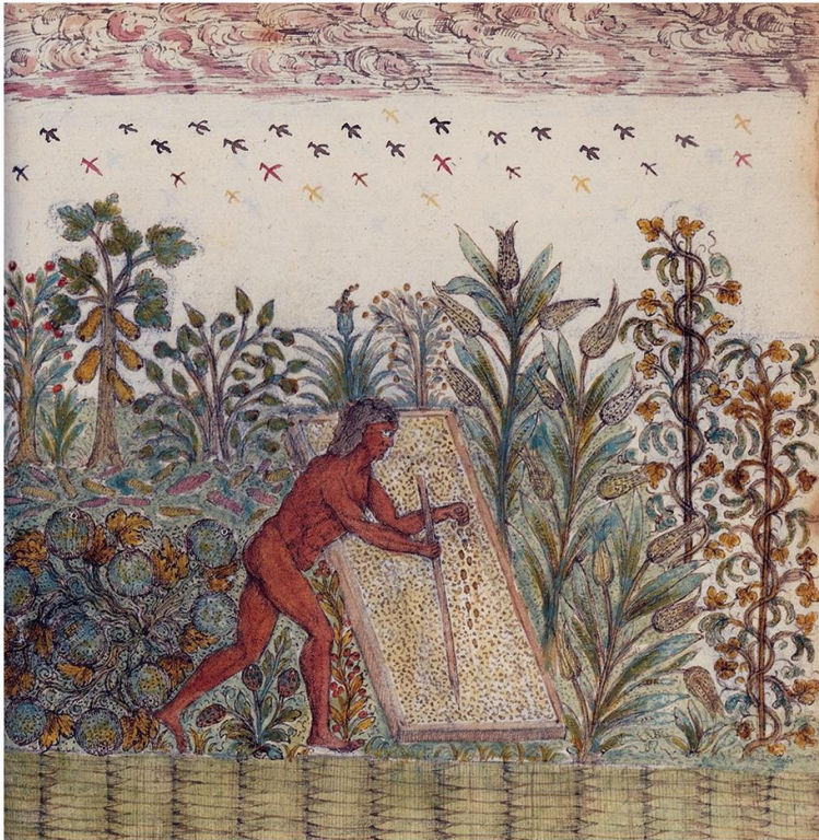
Ancient Agriculture Chapter 1, The American Promise: A History of the United States , Seventh Edition Copyright © 2017 by Bedford/St. Martin's Distributed by Bedford/St. Martin's/Macmillan Higher Education strictly for use with its products. Not for redistribution.